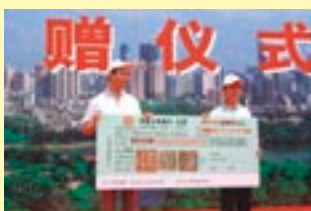
Sponsoring Asian Games

● In addition to making donations to philanthropic organizations in and around the city of Guangzhou, Guangzhou Honda, together with its sales representatives, is helping to sponsor the 16th Asian Games scheduled to take place there in 2010.