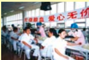
Blood Donation Drive