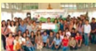
Visiting Welfare Facilities