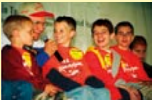
Ride for Kids

Founded in 1969, the National Youth Project Using Mini-bikes (NYPUM) is an intervention program for at-risk youth between the ages of 10 and 16 that has rewarded children for their educational and behavioral achievements with the opportunity to ride Honda mini-bikes.