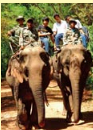
Elephant Patrols for Forest Conservation Project

The Honda Thailand Foundation was established in August 2002 with an investment of 100 million baht on the part of the Honda Group. Guided by the three goals of providing educational support, cultural preservation, and humanitarian assistance, the Foundation is engaged in a variety of charitable activities.