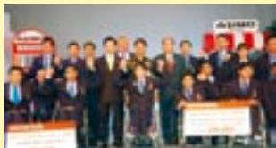
Athens 2004 Paralympics Athletes